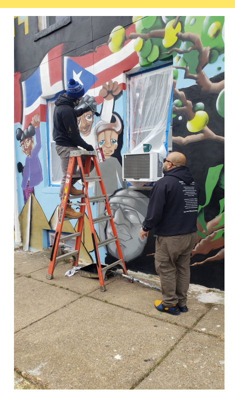
2nd & Scott Mural completed by Nuestras Raíces, 302 Guns Down, & Guerilla Republik